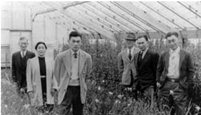
Fred Korematsu and his family