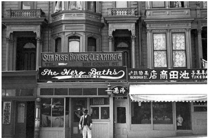
Japantown in 1930s'

San Francisco's Japantown dates from the great earthquake and fire of 1906, when the Japanese population united west of the fire line. Uprooted by World War II, the Japanese were replaced mostly by African-Americans, who brought their vibrant musical heritage with them. The area was one of the first to experience the dramatic changes of 1950s urban