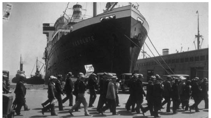
Picket on waterfront

causes of the 1934 General Strike and why it was successful. How was the strike organized and why are the issues in that strike still relevant to working people today? We will also view some of the key historical sites in this important US labor struggle. Be prepared for a long walk, slow pace and no hills.